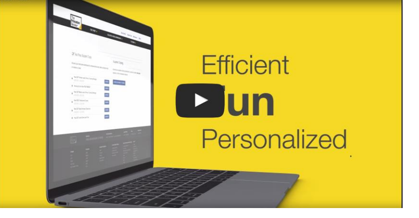
Better Score Guaranteed .

EXCLUSIVE! Chat with a Teacher on the student portal connects you to our expert instructors 1:1 online through test day.