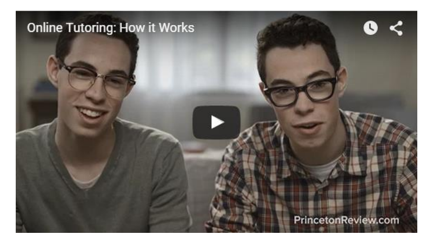
Better Grades Guaranteed.